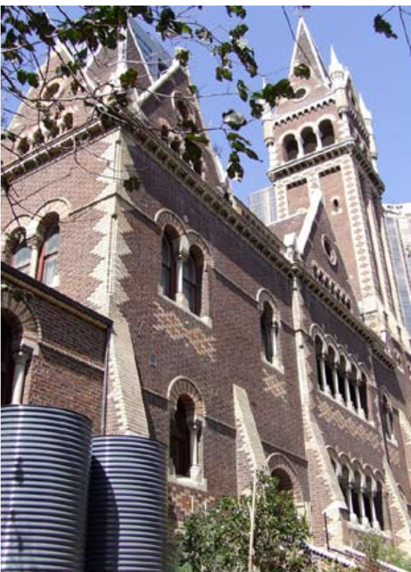
St Michael's Church, Collins Street has done more than a bit of gardening. Their inspired new landscaping has added a breath of fresh air to the city, and a place we can all enjoy.

Please report to Council (9658 9658) any damage you see. And of course ring 000 if you see the sillies on the job!